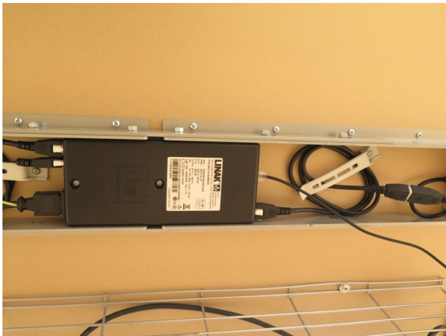
Figure 1 Test specimen, underneath