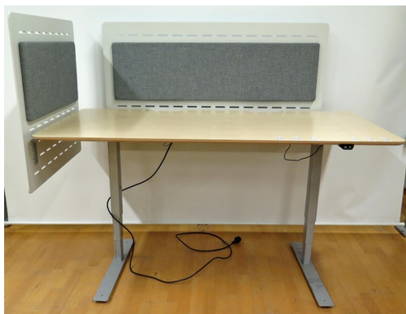
Figure 1 Test specimen

Dimension: W=1600 mm, D=800 mm, H=600-1252 mm Table top: Veneered MDF, 23 mm Frame/Leg: Metal Actuator: Linak 2-pillar T-stand: Pillars in metal, 3 parts, 80 x 51mm, 74 x 44 mm, 67 x 37 mm Functions: Electric adjustable in height 600 - 1252 mm