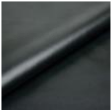
Artificial leather Highland Vintage 16802 Green 2001312