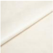
Artificial leather Highland Vintage 10013 Off white 2001302