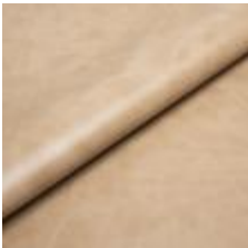
Artificial leather Highland Vintage 10195 Beige 2001303