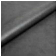
Artificial leather Highland Vintage 06792 Grey 2001306