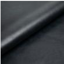
Artificial leather Highland Vintage 19750 Blue/Grey 2001309